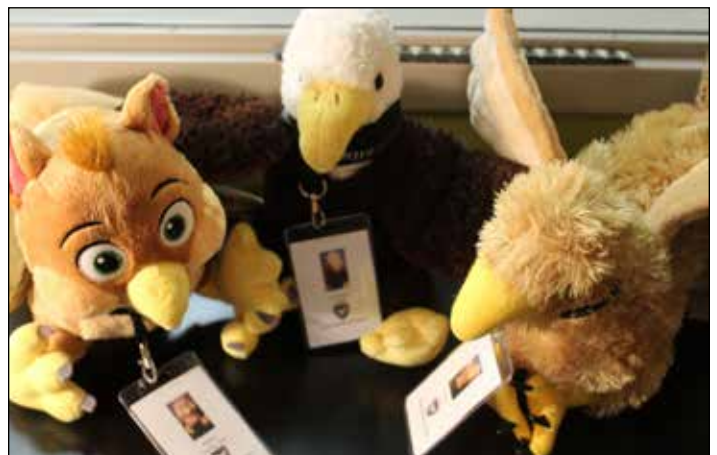
MEET THE PILLAR PALS: Thunder Claw (Respect), Aquila (Citizenship), and Gryff (Integrity).

Aquila will be helping classes notice and recognize Citizenship in one another. Gryff will do the same for Integrity and Thunder Claw will be given in recognition of Respect. We are excited to help our students look outside of themselves and celebrate the truth, beauty and goodness they see in those around them. I wish you all a very good Fall Break and we're very much looking forward to seeing each of you during conferences!