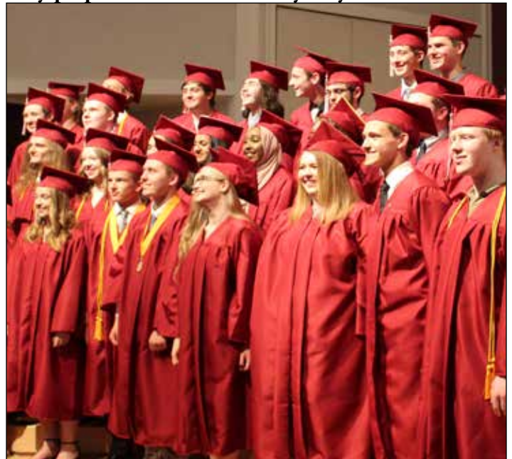
Members of the Class of 2017.

Eagle Ridge Academy does both. We offer students a strong background in math and science and students receive a deep understanding of humanity. Students who are immersed in great literature and the beauty that a liberal arts education combined with skill of math and science are poised to enter their post-high school endeavors fully prepared for whatever they may choose.