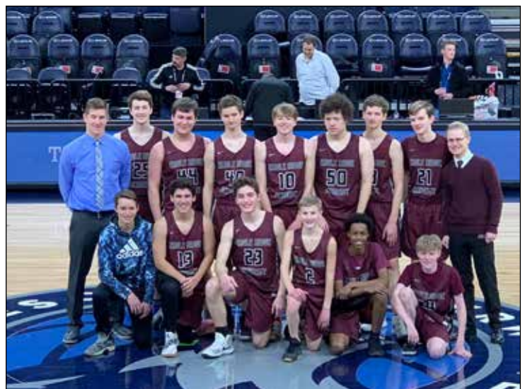
The Girls and Boys Varsity Basketball teams played Twin Cities Academy on Saturday, Jan. 19 at the annual Target Center game.